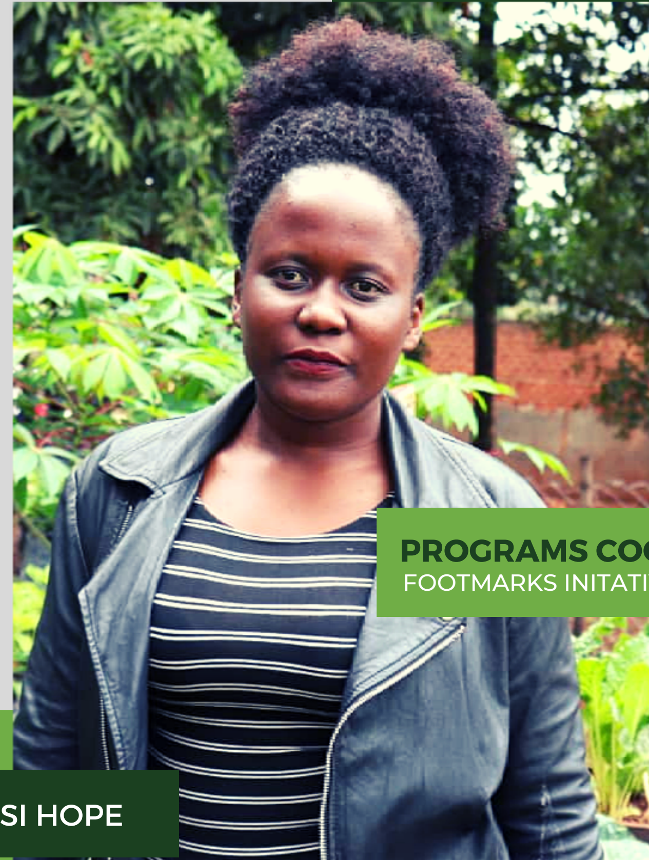
PROGRAMS COORDINATOR FOOTMARKS INITIATIVE UGANDA

Together with our partners, FIU will continue to deliver for youths in Uganda on both the premise and promise of the 2030 Agenda inclusive of the youth Agenda and its global goals, seeking equality for all.